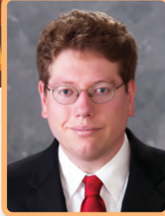
COMMISSIONER JOHN PLECTNIK