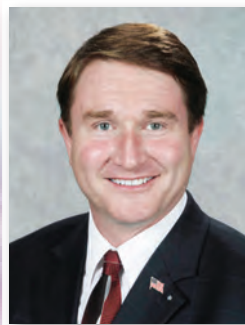
COMMISSIONER JOHN HAMERCHECK