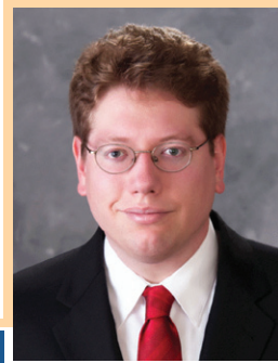
COMMISSIONER JOHN PLECNIK